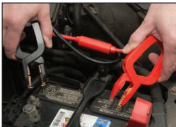
Detach Clamps From Battery