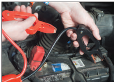
Attach Black (-), Then Red (+)