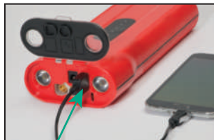
USB-A Output Port

You can charge your USB-A devices by plugging in your USB-A cord into your Weego 70 USB-A port OR by plugging your own USB-C to USB-C cord into your Weego 70 USB-C input/output port. Connect to your device, power on Weego 70 and start charging!