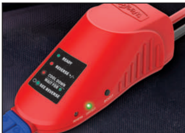
When You Have SOLID GREEN LIGHT On Your Smart Box, Start Your Engine