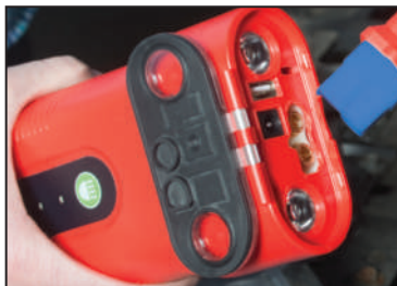
Once it Starts, Disconnect Clamps from Weego 70